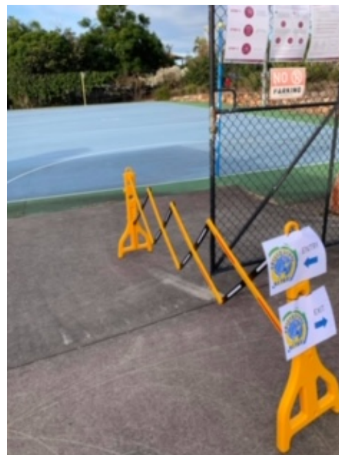
COVID-19 Return to Play